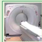
MRI/CT Scan Machine